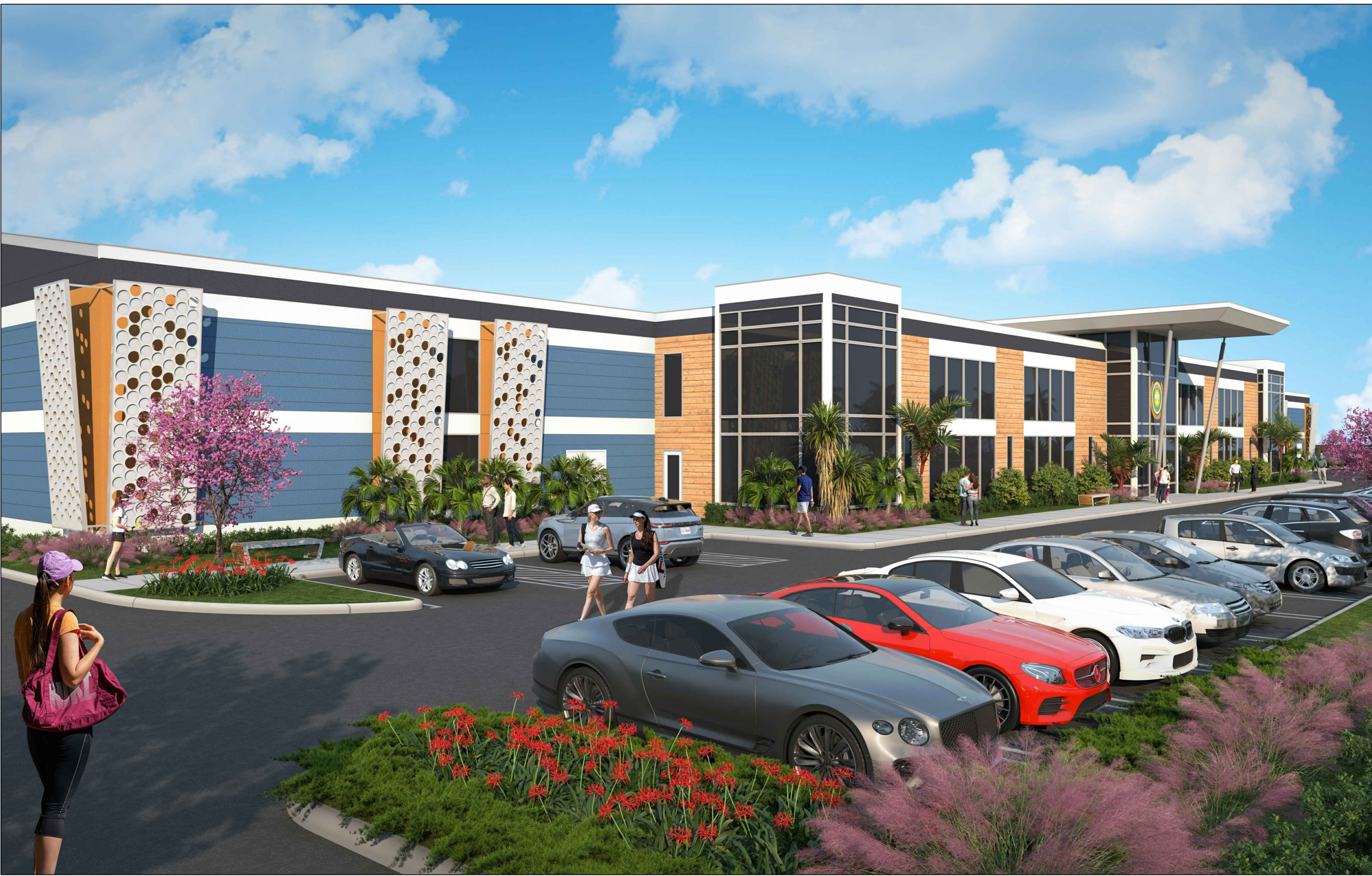
NORTH EAST CORNER VIEW