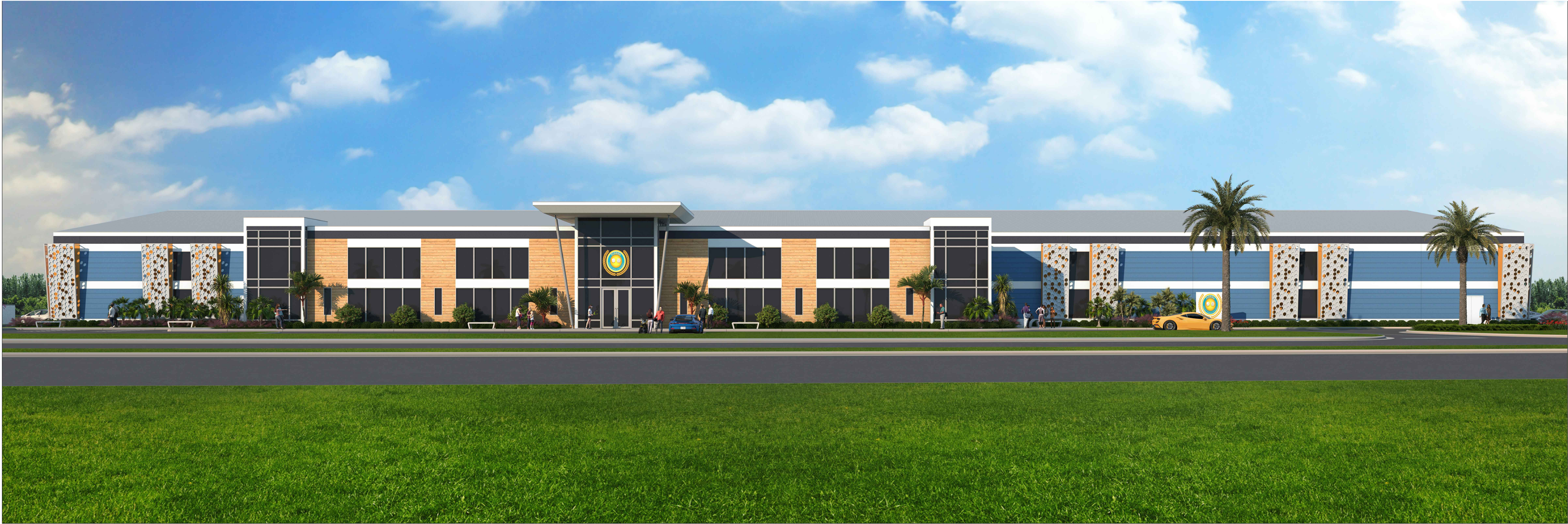
FRONT (SOUTH) VIEW