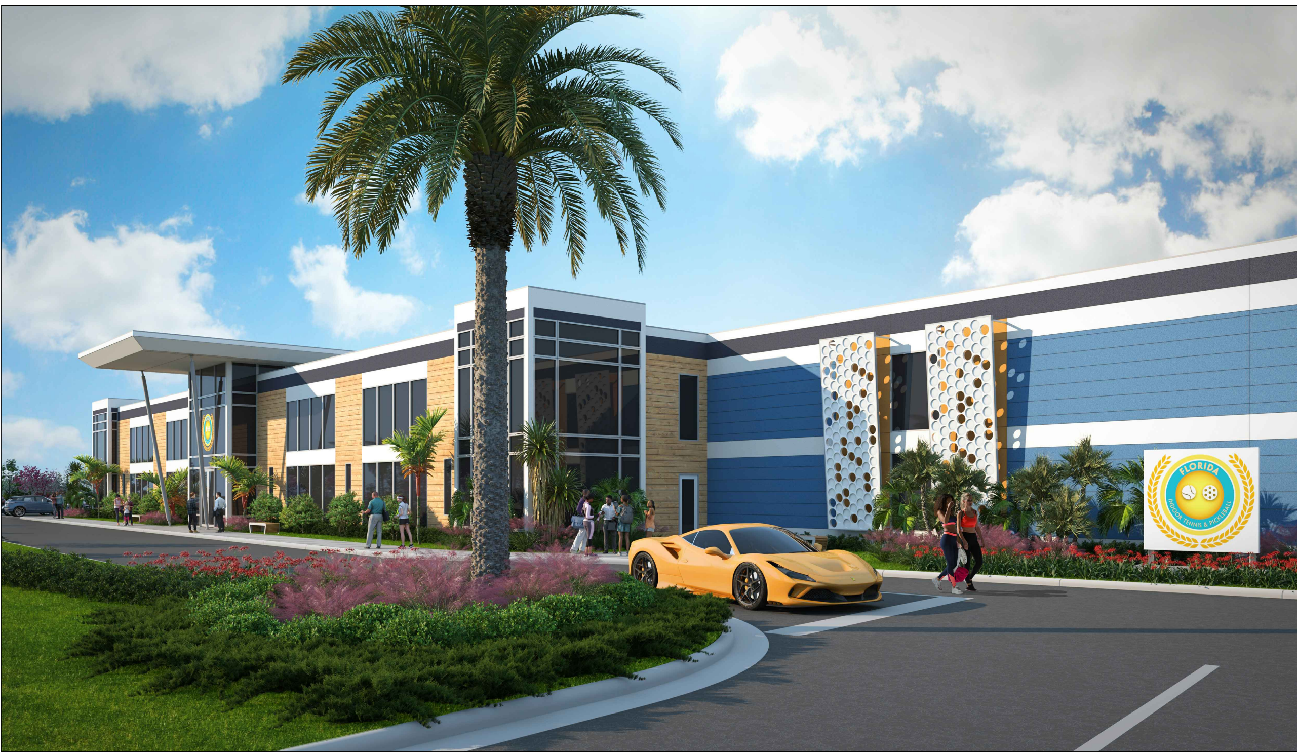
DRIVEWAY ENTRY VIEW